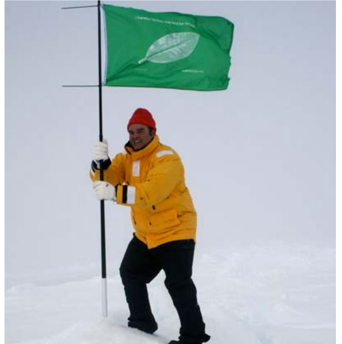
Native Flags, North Pole, 2008