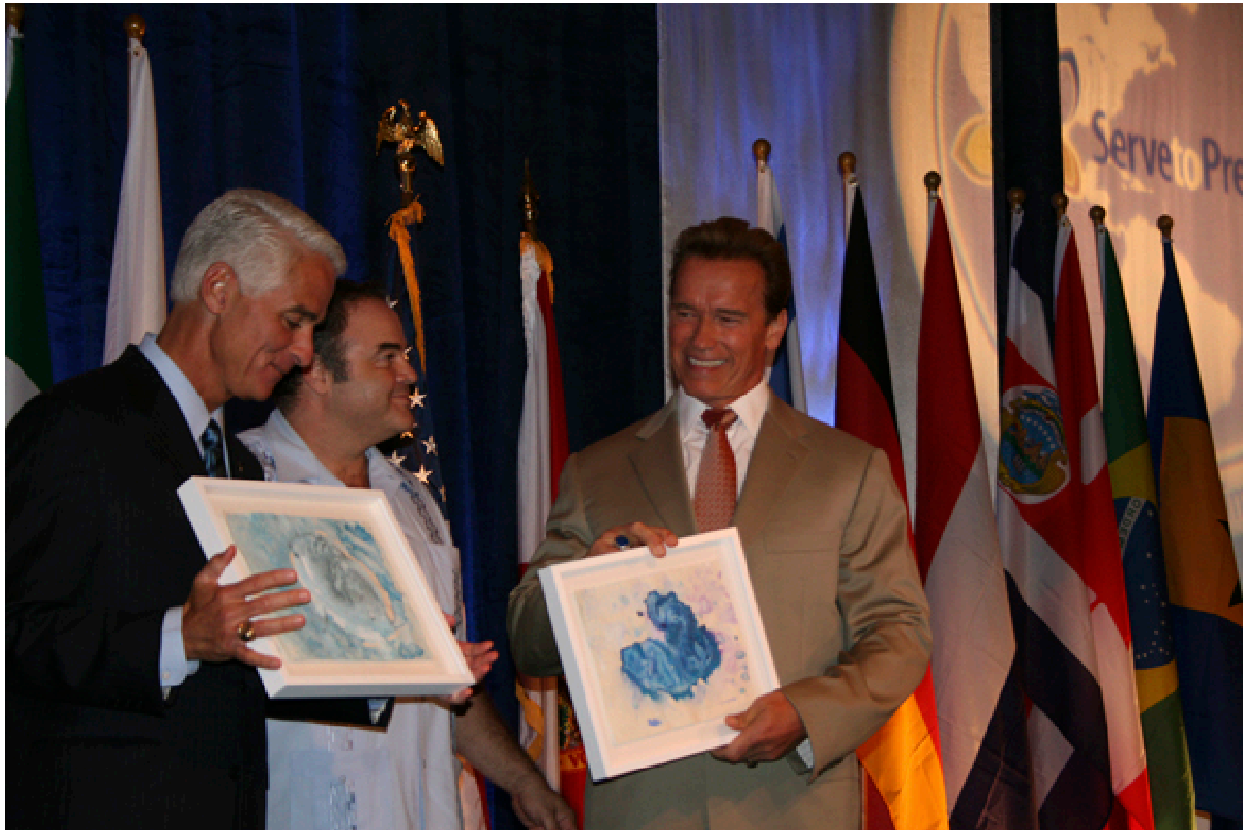
Presentation of Antarctic Ice Paintings to Governor Crist and Governor Schwarzenegger