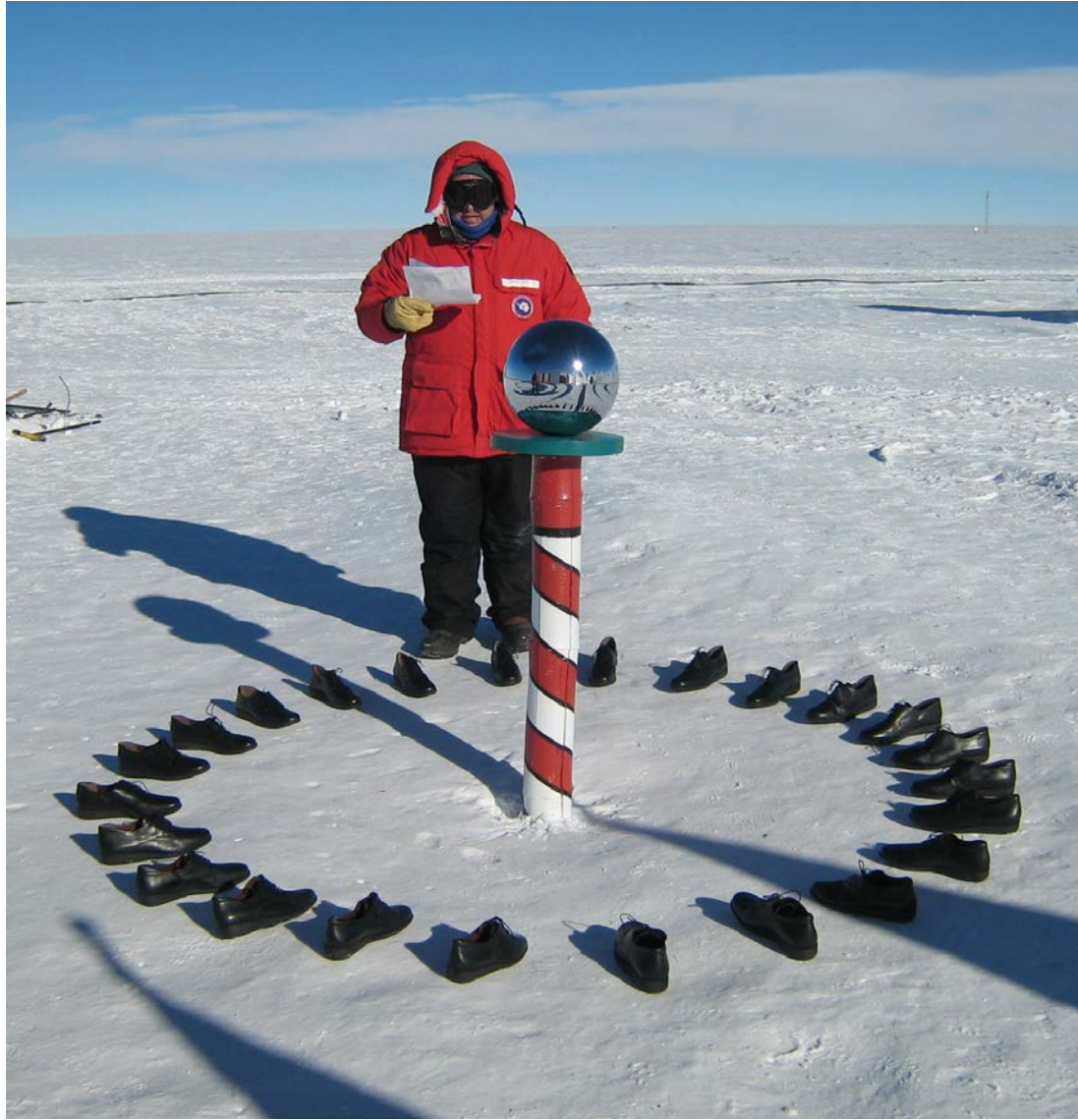
Longitudinal Installation, South Pole, 2007